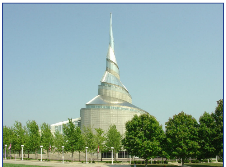
Community of Christ Temple, Independence, MO